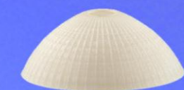
1126- FS H: 16, ø: 35 1147 Ø350мм (білий мат)

http://brassvit.info/ brassvit@mail.ru 2012