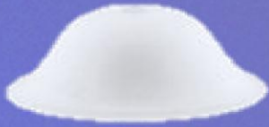
1128-A-1 H: 13, ø: 30