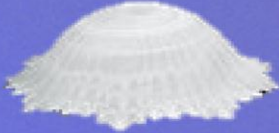
112 H: 14, ø: 38 112-A H: 10, ø: 31 112-B H: 10.5, ø: 15 112-C H: 11, ø: 15