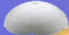
114 H: 14, ø: 34 114-A H: 12, ø: 25 114-B H: 10, ø: 17