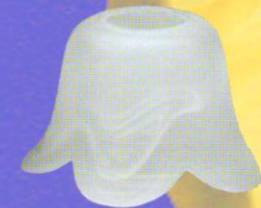
101-D H: 11, ø: 13