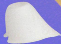
1197-B H: 11, ø: 13